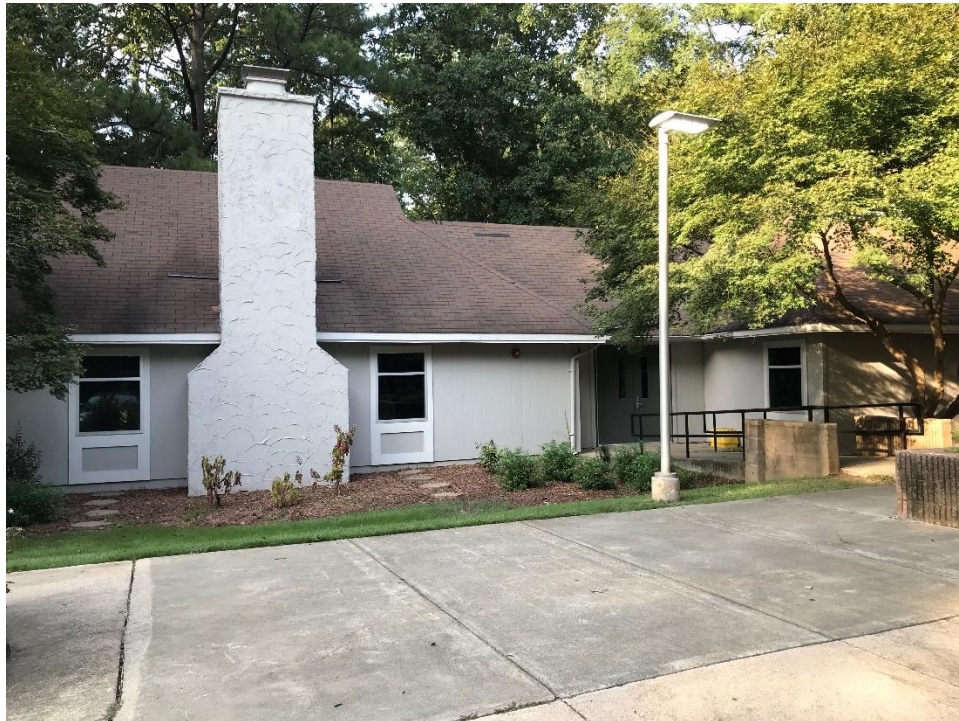
Eastgate Community Center