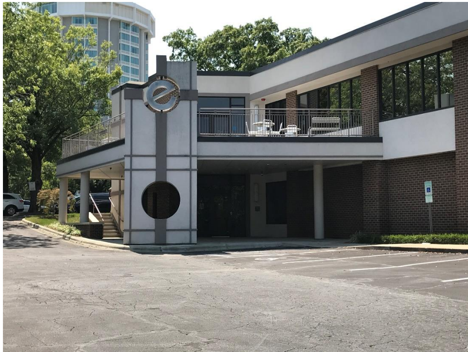
Edenton Street United Methodist Church