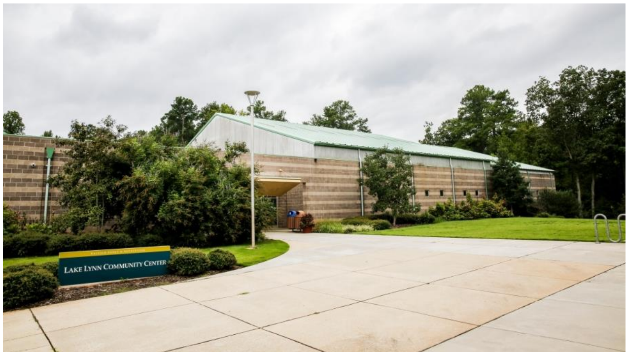
Lake Lynn Community Center