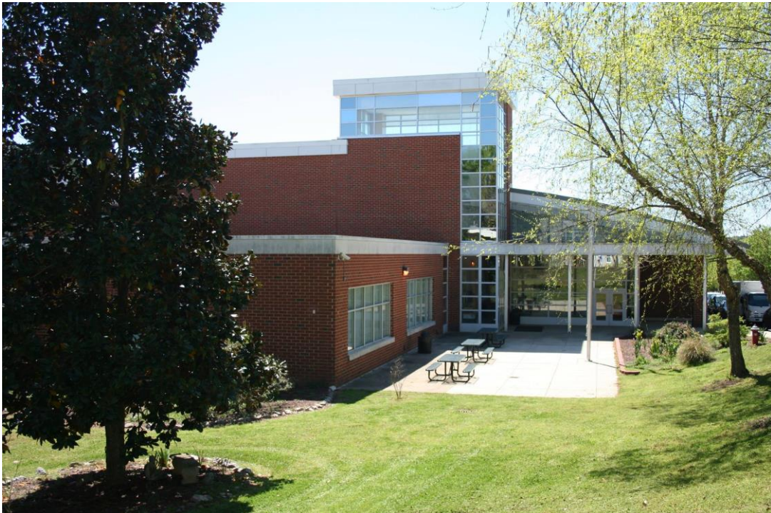
Carnage Middle School