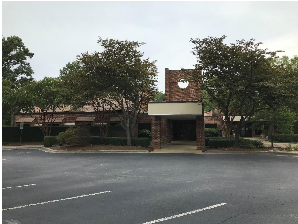
Cary Presbyterian Church