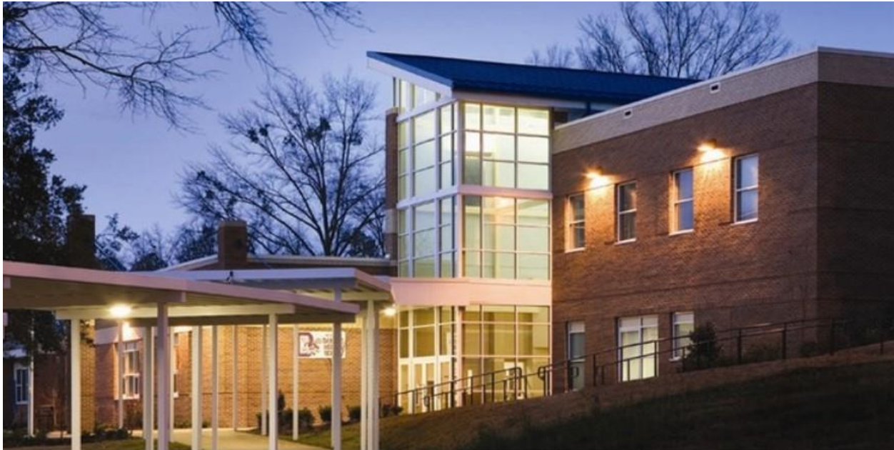
Oberlin Magnet Middle School

Registered Voters: 1,320 Old Facility Name: Daniels Middle School 2816 Oberlin Rd. Raleigh, NC 27608 New Facility Name: Oberlin Magnet Middle School 2816 Oberlin Rd. Raleigh, NC 27608