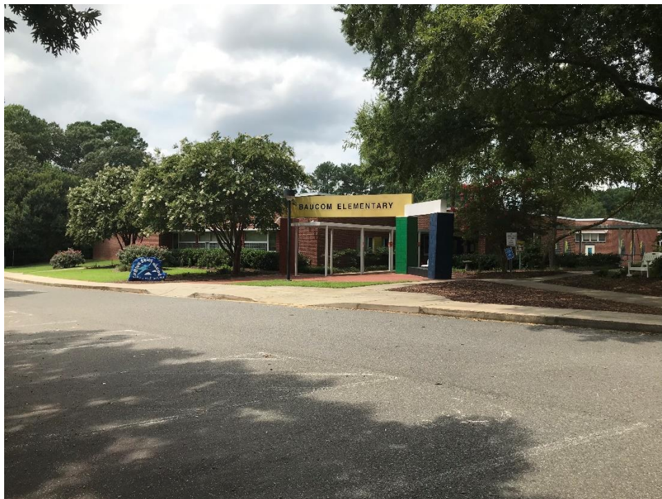
Baucom Elementary School