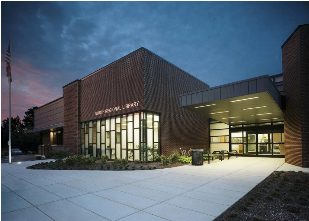
North Regional Library