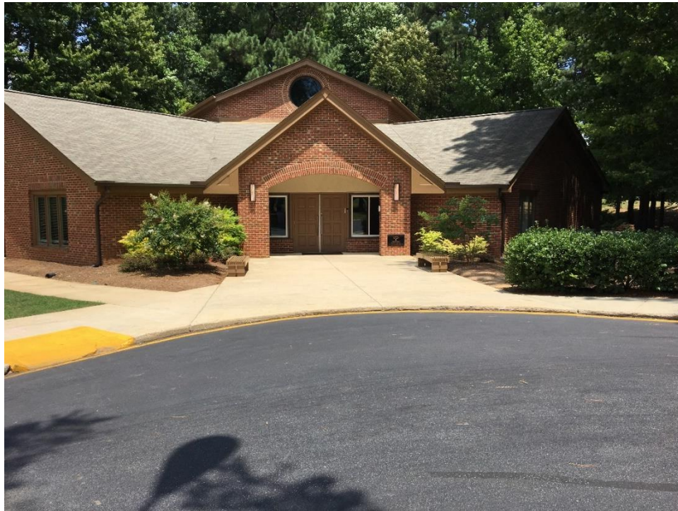
Sha'arei Shalom Congregation